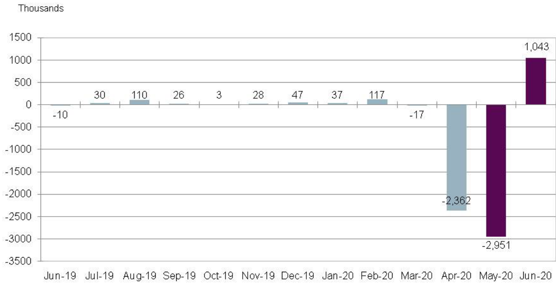
Chart 1. Change in Total Nonfarm Payroll Employment